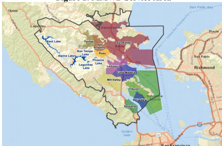
Figure 1: MMWD Service Area