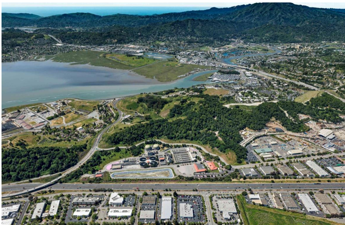
Central Marin Sanitation Facility in San Rafael