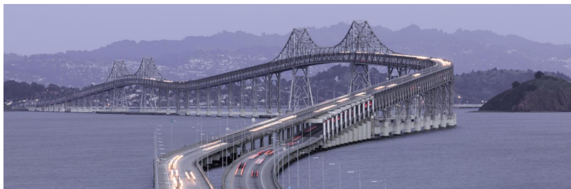
Richmond-San Rafael Bridge

Lack of action on water resilience options and the prospect of reservoirs running dry in mid-2022 forced MMWD to initiate emergency planning for purchasing and importing up to 10,000 AF of Central Valley water via a new $100 million pipeline to the East Bay. The District has already spent about $10 million on plans and materials and initiated a $1.5 million environmental impact report on this option. Heavy rainfalls at the end of 2021 alleviated the emergency by refilling MMWD's reservoirs, but a worrisome dry start to 2022 and the long timeline needed to implement other drought-proof resilience measures leave this option on the table.