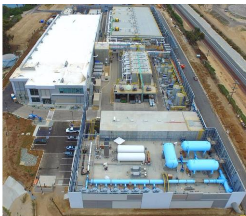
Carlsbad Desalination Plant

Large scale desalination plants that produce potable water for major population centers are in use around the world. A notable example is a plant in San Diego County that produces 50 million gallons per day or more than 56,000 AF per year. The plant, pictured at left, is situated on 95 acres adjacent to the Encina Power Station and owned and operated by Poseidon Water. The Poseidon plant started operation in 2015 and reports that it produces water for ½ cent per gallon, or $1,600 per AF, in large part due to its high volume. 33